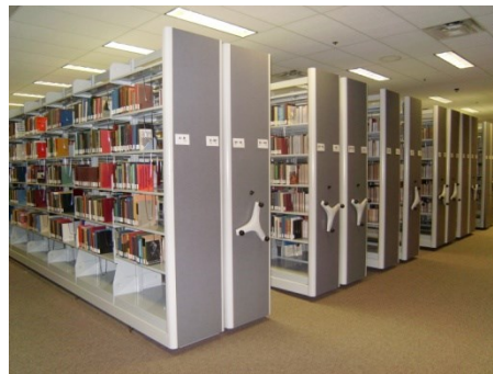
1st Floor General Books Section

Wallace Library uses the Library of Congress Classification (LCC) system to organize books, as opposed to the Dewey Decimal System. LCC divides all knowledge into 21 classes. Each class has subclasses. For example, call numbers starting with 'B' are in a class dedicated to philosophy, psychology, and religion. This class is further divided into subclasses, such as 'BS' for the Bible.