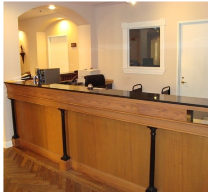
Main Floor Service Desk